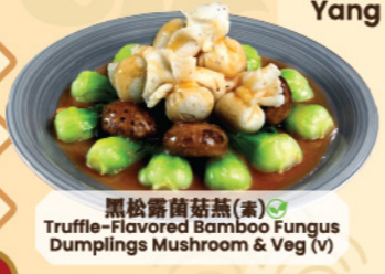
黑松露菌菇燕(素) Truffle-Flavored Bamboo Fungus Dumplings Mushroom & Veg (V)