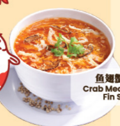
鱼翅蟹肉羹 Crab Meat Shark's Fin Soup