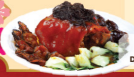
蚝豉发菜元蹄 Pig's Trotters w Dried Oysters & Fa Cai