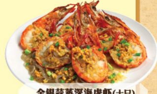
金银蒜蒸深海虎虾(十只) Steamed Wild-Caught Tiger Prawns w Garlic (10pcs)

Scratch & Sure-Win PRIZES WORTH UP TO 刮刮乐赢取奖品价值高达 $108,888 Grand Lucky Draw WIN CASH UP TO 幸运抽奖赢取现金高达 $12,000