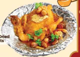
干贝栗子富贵鸡 Prosperity Chicken w Dried Scallops & Chestnuts