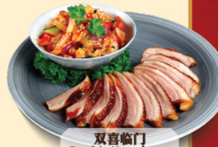
双喜临门 Double Happiness Platter