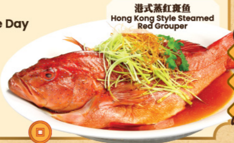
港式蒸红斑鱼 Hong Kong Style Steamed Red Grouper