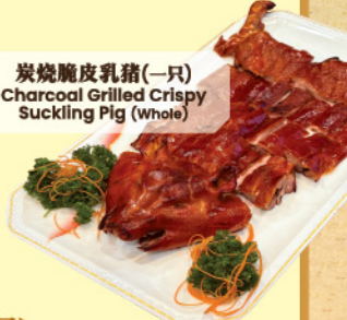
炭烧脆皮乳猪(一只) Charcoal Grilled Crispy Suckling Pig (Whole)