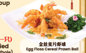
金丝麦片虾球 Egg Floss Cereal Prawn Ball